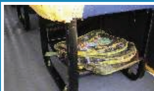
Racks for School Bags