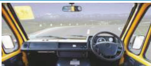
Smart Dashboard, Convenient Controls