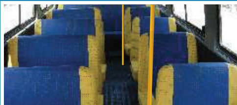
Spacious Seating Layout