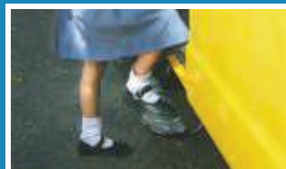
Low foot step for easy Entry & Exit