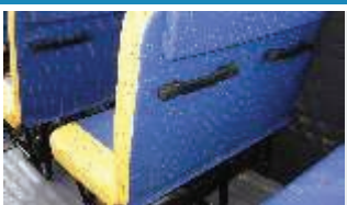
Chin Guard & Grab Handle